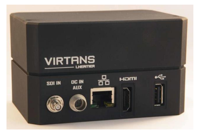
Figure 4 Current prototype of the VIRTANS platform

In this section we introduce the VIRTA family and its first born: the VIRTANS. VIRTA stands for Video Real-Time Algorithm and NS for Noise Suppression. VIRTA aims to provide a new embedded platform to perform heavy real-time video processing algorithms. It is currently in its early development stage and the first algorithm to be deployed on, is RTE-VD. With RTE-VD, VIRTA becomes VIRTANS. It is based on the industrial version of the TX2 architecture and comes in a pretty small form factor (cf Fig. 4).